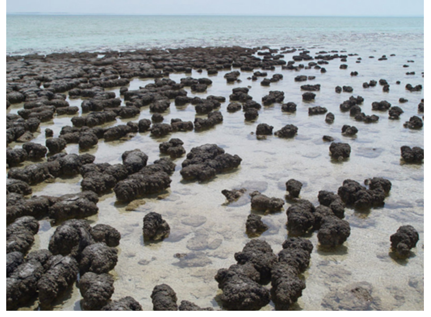
Stromatolites, Shark's bay