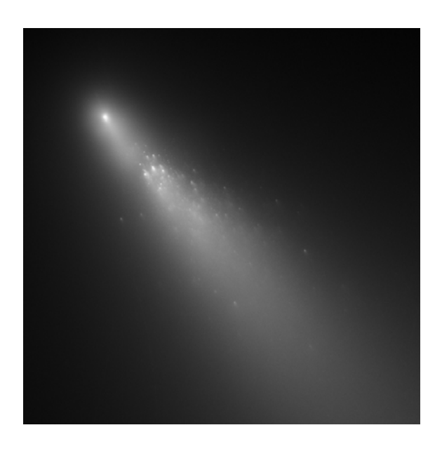
Figure 1 : Fragment B and accompanying 'ice-shards', probably several tens to perhaps a few hundred meters across, produced during the 2006 fragmentation event of Comet 73P/ Schwassmann-Wachmann 3.